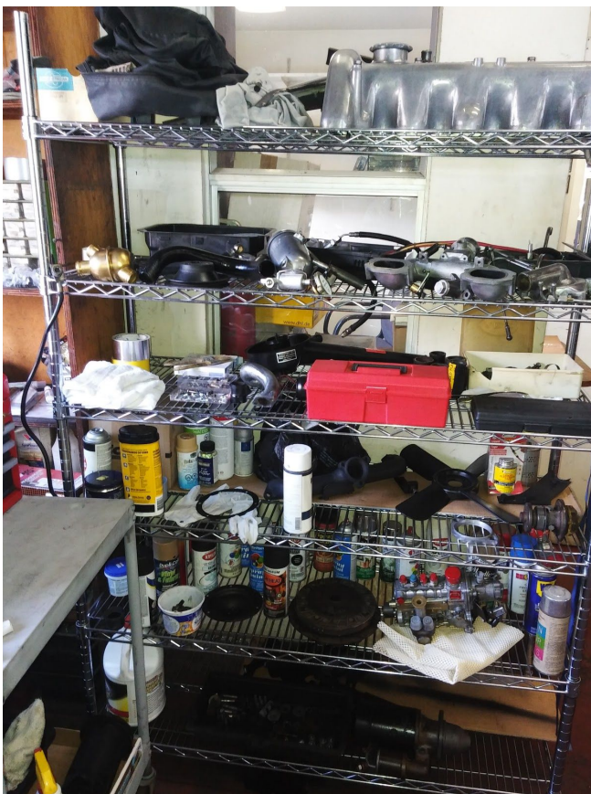
The MORGUE with VICTIM's GUTS